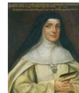
St. Mary Euphrasia Foundress of Good Shepherd Sisters