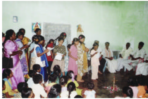
The oath taking ceremony of children after the parliamentary elections towards self-governance is witnessed by the local Government personnel, in one of the villages in the outskirts of Bangalore.

millennium, the vulnerable and the voiceless, whether from the rural or urban areas, are denied their basic necessities, their access to information, and to education which will lead our people to liberation, to empowerment. It is the call of the hour for the Shepherdesses to look for alternative solutions and continue to challenge the corrupt system that devalues life.