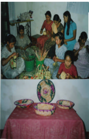
Girls at the Skill Development Centre

Living in difficult situation in Nepal is a challenge to our sisters, but our commitment to the cause of the young girls and women continue to give meaning and purpose to strive towards